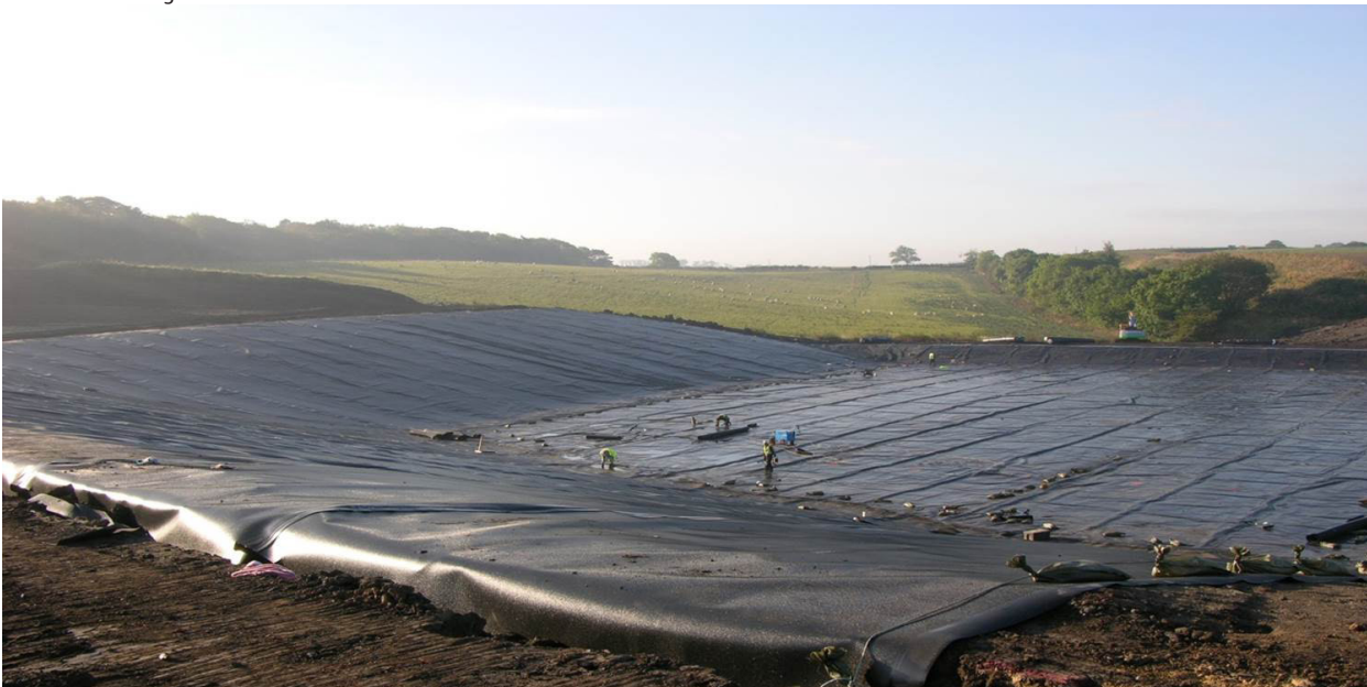
Example application: Landfill, Scotland, textured upper and smooth underside membrane.

(g) Roll widths and lengths have a tolerance of ± 1%