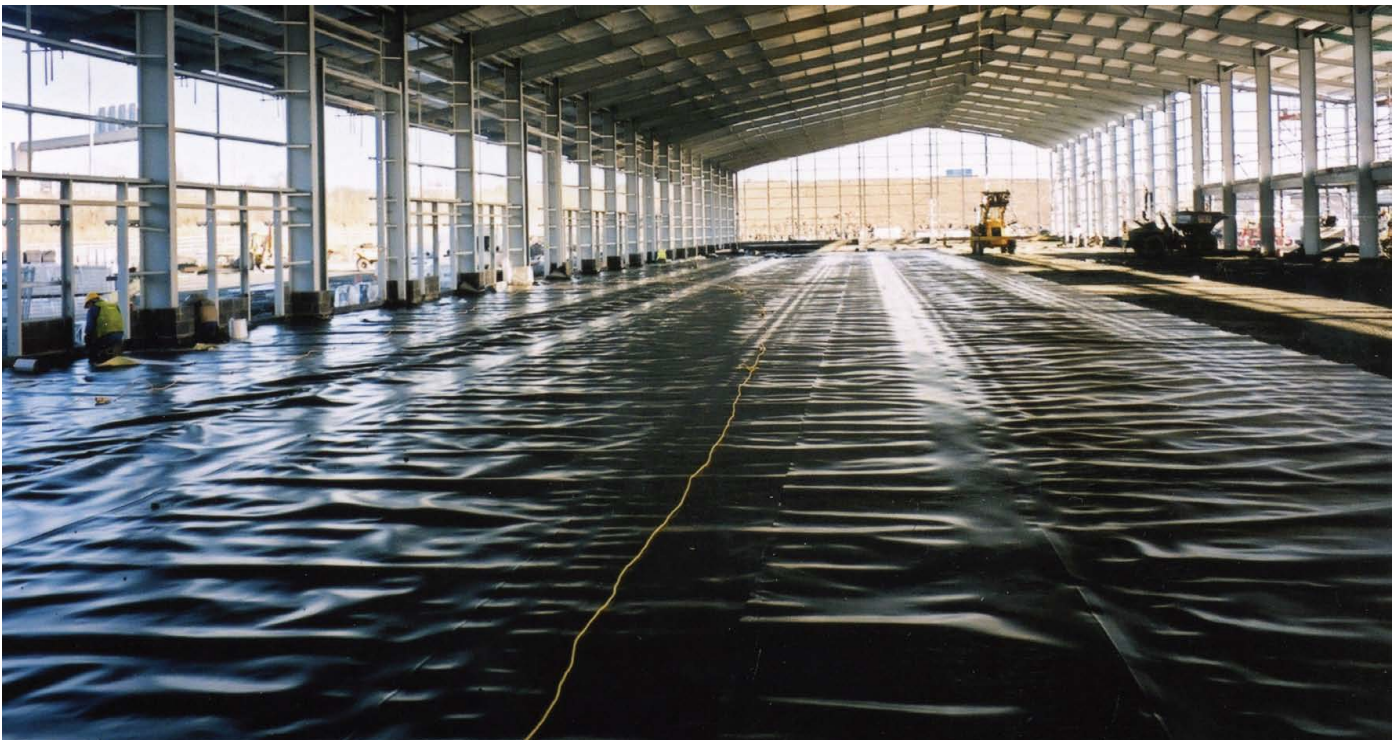
Cambuslang Investment Park, Gas Protection: W A Fairhurst & Interserve

With this in mind, Butek Landline select the most appropriate material and install in accordance with a fully certified CQA system. The system enables independent engineers to monitor the progress of the installation and allows for provision of documented Quality Assurance manual on completion of the works. Installations performed in this manner are deemed to be at least risk of failure. (C665, Table 5.3).