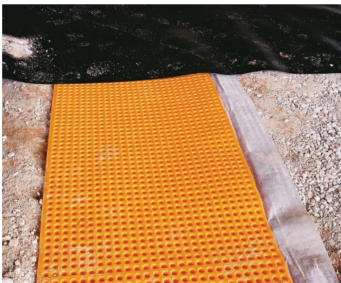
Landflex ZR Venting Geocomposite