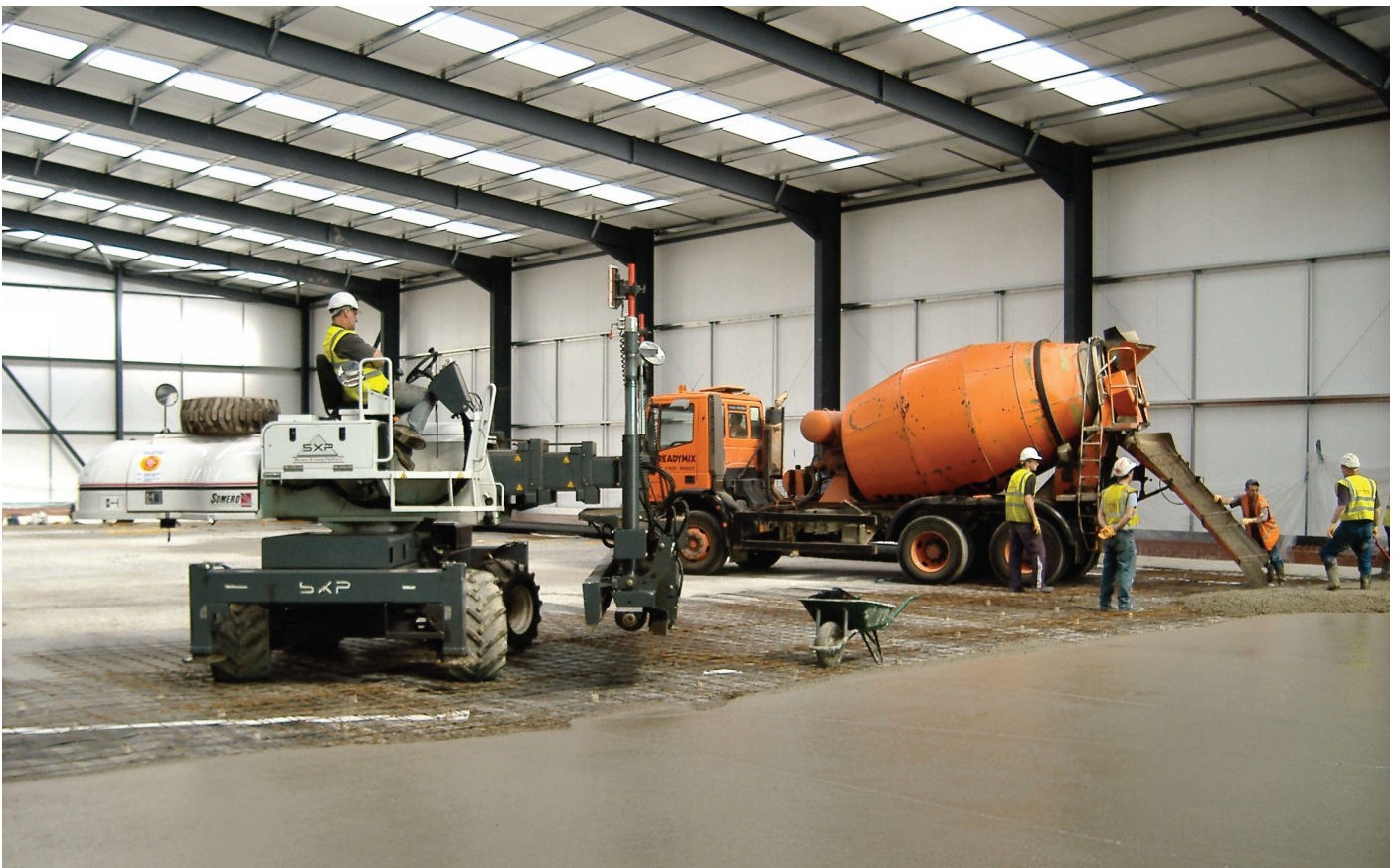
Ridgeons Sudbury, Laser Screeding over PE200HD 2.0mm Landflex HDPE gas membrane

Our full understanding of regulatory requirements, coupled with single source responsibility, allows contractors and designers alike to be provided with a comprehensive warranted solution for all gas and hydrocarbon contaminated sites.