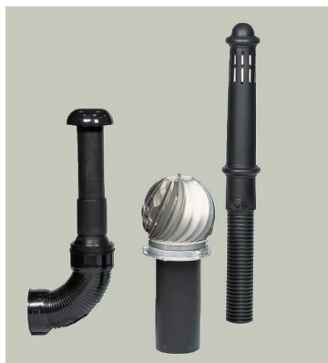
Landflex ZR Vent Outlets