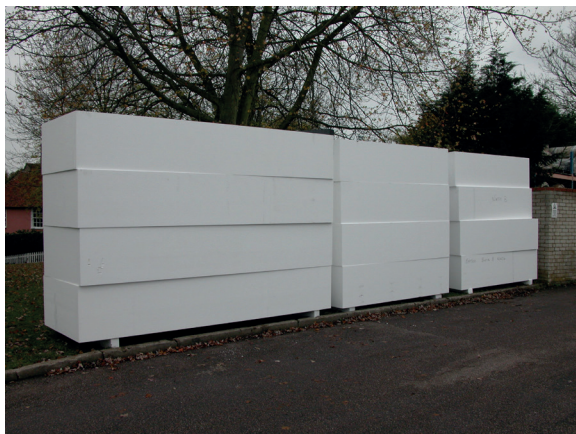
Example application: EPS block wrapping