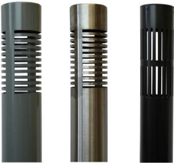
Available Gas Venting Bollard Varieties

Our bollards are manufactured in the UK and are designed to look exactly like standard bollards, enhancing the building surroundings and performing a multi-function as required.