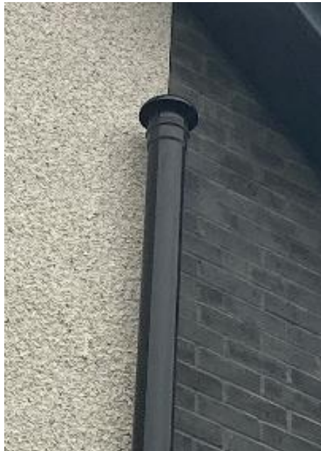
Mushroom Cowl Gas Vent Cap

Please contact our technical sales team for further details.