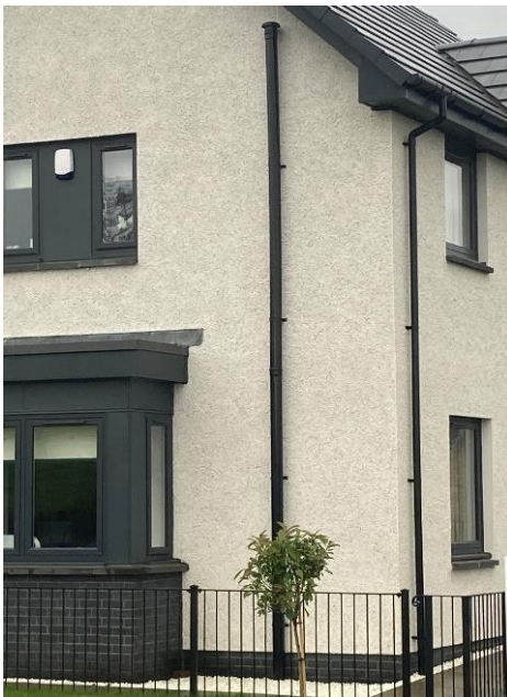
150mm Gas Vent Stack with Mushroom Cowl on Top