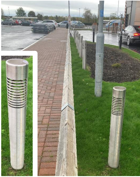
Typical Gas Venting Bollard Detail

Butek Landline designs, manufactures and stocks its own ZR range of methane gas venting components suitable for all internal and external venting requirements. Items include venting geocomposite; vent boxes and lids; radon sumps; gas venting stacks and bollards; aspirating cowls and attachments; periscopic airbrick vents; slotted and standard pipework; geocomposite coupler tees; cross vent connectors; bends, tees and couplers; high strength invert adjustable bollards; stainless steel covers, frames and attachments. All items are designed to be compatible and to work together to form a complete gas venting solution. Components are available ex-stock and may be supplied singly or as a package to contractors wishing to install the system themselves.