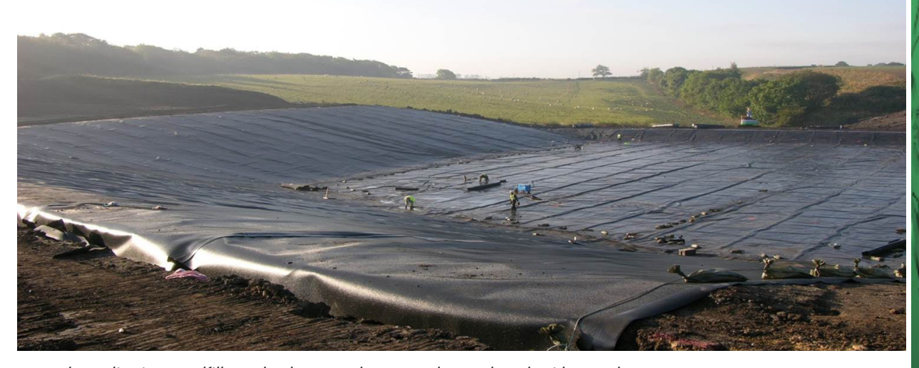
Example application: Landfill, Scotland, textured upper and smooth underside membrane.