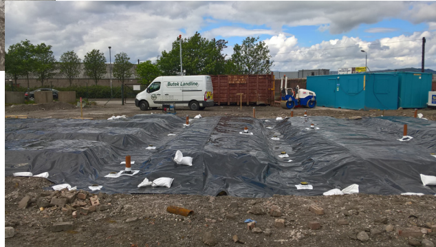
Landflex™ Titanflex in position

Landflex™ Titanflex Hydrocarbon Barrier is a multi-layer flexible membrane, with a unique core compound which is designed and manufactured to provide a barrier to the most aggressive chemicals and to comply with current guidance on Hydrocarbons. Manufactured using the latest extrusion technology and drawing on our extensive knowledge and expertise in gas protection, the new membrane is suitable in all applications that are affected by Hydrocarbons.