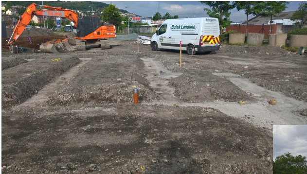
Site preparation underway in advance of Landflex™ Titanflex installation